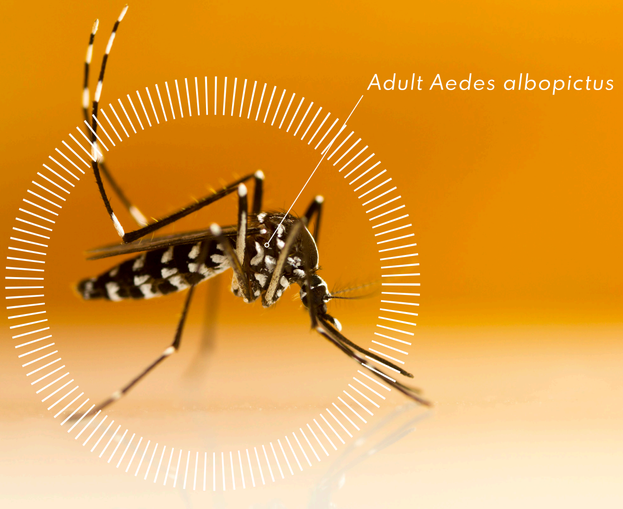
Adult Aedes albopictus

Mosquitoes have been documented as pests in Georgia since the earliest English settlers arrived on the coast in the early 1700s, and the insects were sure to be a problem before that. Mosquitoes continue to be the most important public health pest in Georgia, transmitting a variety of pathogens to people, pets, and wildlife. Each year, cases of mosquito-borne diseases are reported in Georgia, and the sheer nuisance of mosquito populations has resulted in a robust mosquito control profession. Today, integrated mosquito management (IMM) is conducted using the widely accepted concept of integrated pest management (IPM). This approach uses all of the available and necessary techniques and products to conduct a comprehensive program in which pest populations are efficiently managed to minimize economic damage, public health risk, and non-target impacts. To suppress mosquito populations using an IPM-based approach, it is critical to understand the biology and behavior of these important pests.